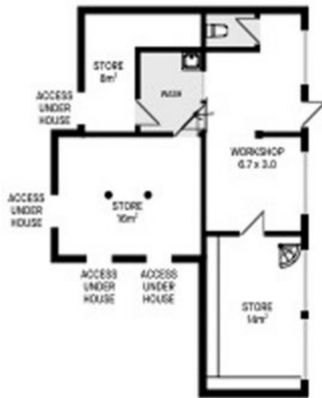
Lower ground floor