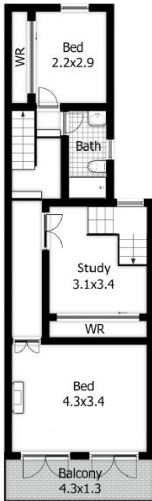
MIDDLE LEVEL FLOOR PLAN