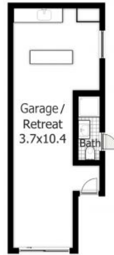
(NOT IN POSITION)